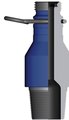
Rotary threads manufactured in accordance with API Spec 7-2